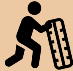
Running Track & Cross fit Zones